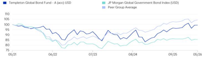
Source: Templeton Global Bond Fund as of 31 May 2026